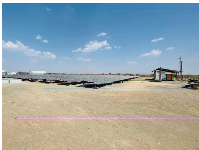
Figure 1: Project Photos