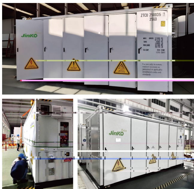
Figure 1: Project Photos

For the global energy storage system (ESS) market, JinkoSolar promotes UL, IEC, and regional-specific certified products such as battery cells, modules, packs, racks, and DC battery blocks. For the DC side market, JinkoSolar's most popular offerings are the fully integrated 20-foot DC battery container block solutions that come in 2 variants – the air-cooled version at 1.5MWh and the liquid-cooled version at 3.4 MWh.