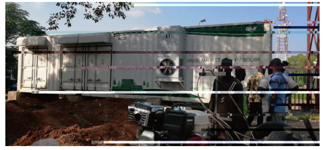
Figure 1: Project Photos